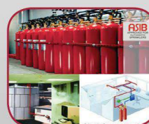
GAS SUPPRESSION SYSTEMS