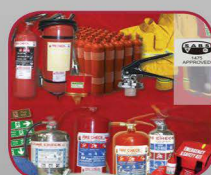
FIRE EQUIPMENT & SAFETY