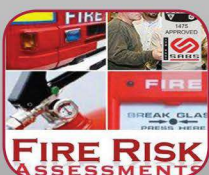
FIRE RISK ASSESSMENT