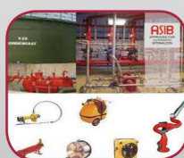
AUTOMATIC FOAM SYSTEMS