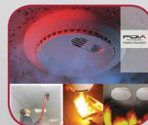
SMOKE DETECTION SYSTEMS