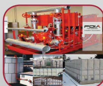
PUMPS & TANKS